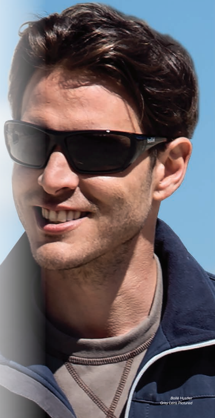
Bolle Hustler Grey Lens Pictured

Voodoo POLARISED Brown - 1652719 $74.95 EA