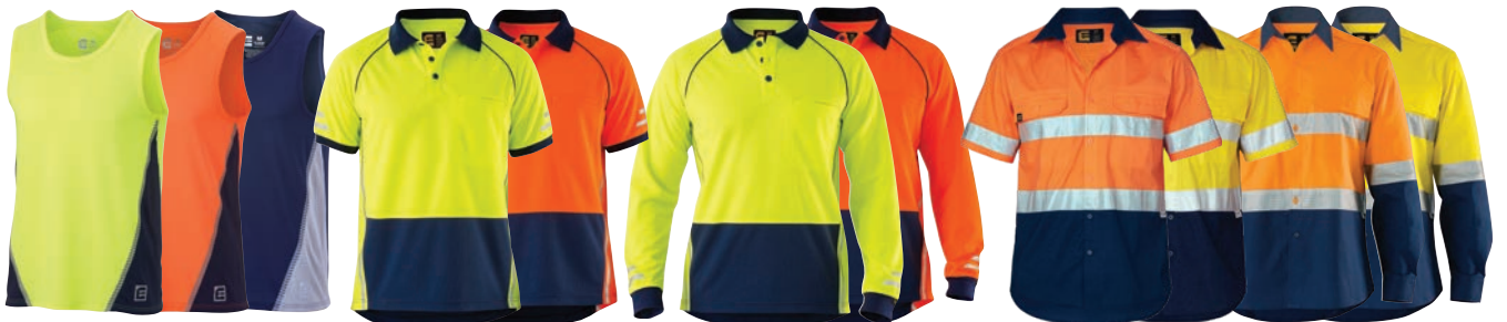
E1370ST L/S Hi-Vis Spliced Shirt with Perforated 3M™ Tape