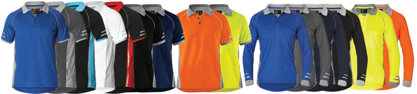
E1427 L/S Hi-Vis Polo Shirt